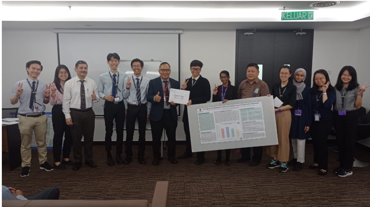
The energetic group that presented Medication Safety Measures in Use