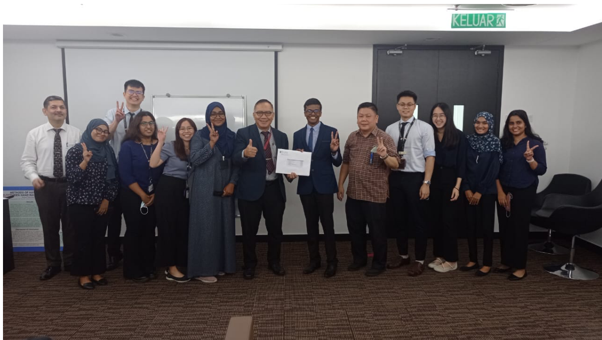
Charismatic students who presented The Prevention of Central Line Associated Bloodstream Infection (CLABSI)

Congratulations and a big round of applause to the winners for a job well done.