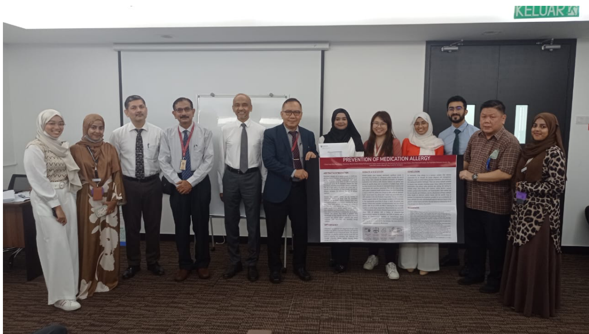
Prevention of Medication Allergy presented by a group of dynamic students